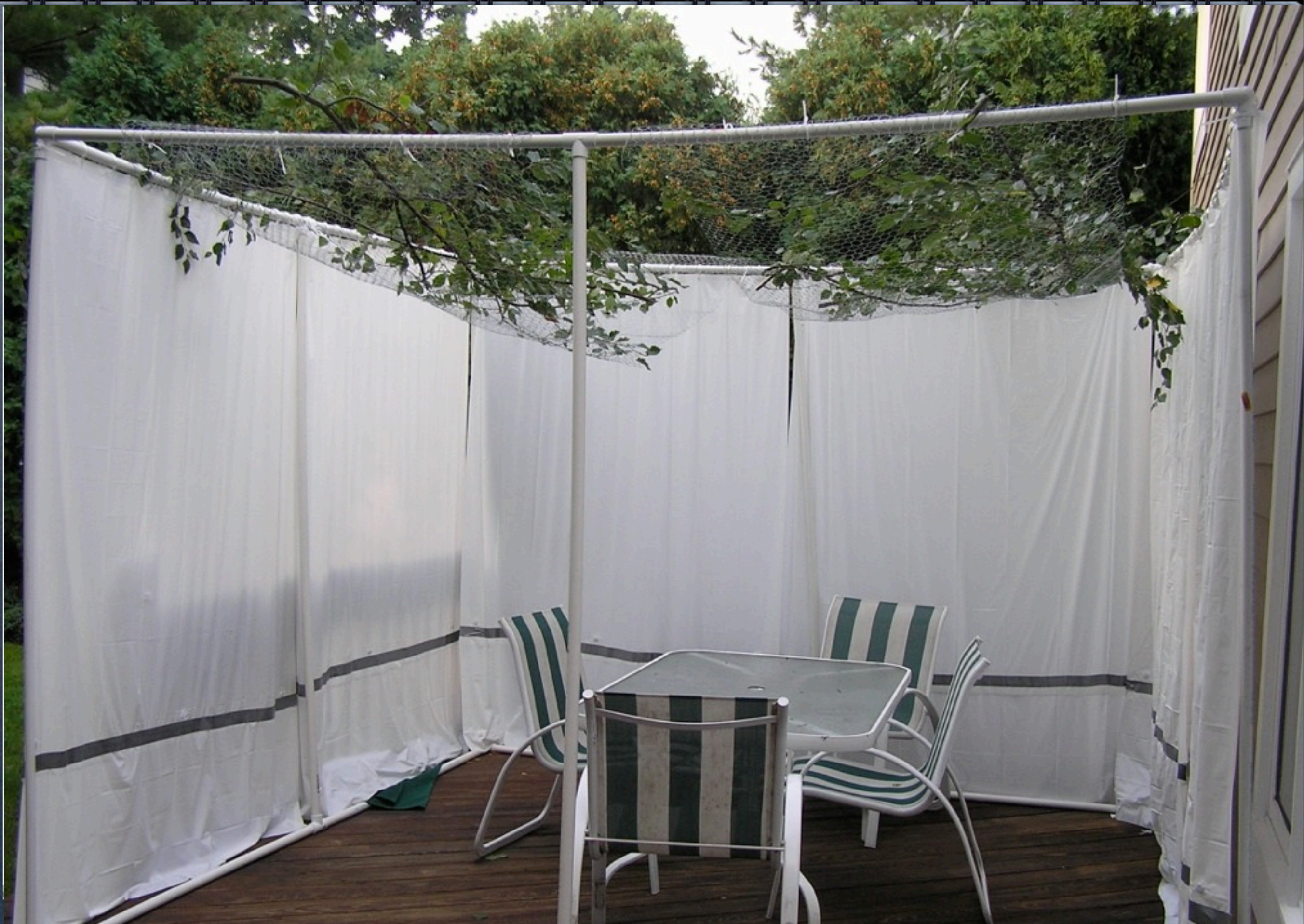
Friday, September 28, 12