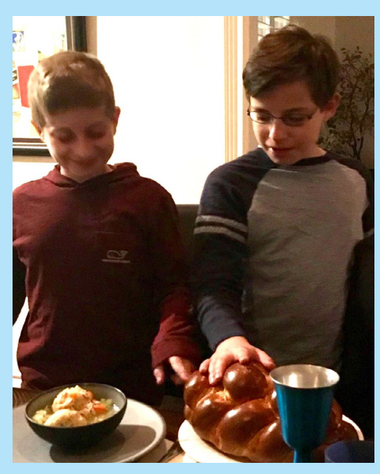
5th Grade at Home Shabbat brought lots of families together with friends, both new and old!