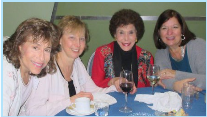
Synaplex fun continues! We are looking forward to March 23rd!