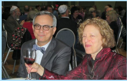
We had 2 amazing Syanplex Shabbats two weeks apart! What amazing times we are having on these Fridays together