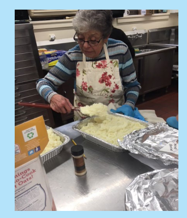
Our Cooking for the Homeless Group is doing such an important mitzvah each month, while also having a great time!