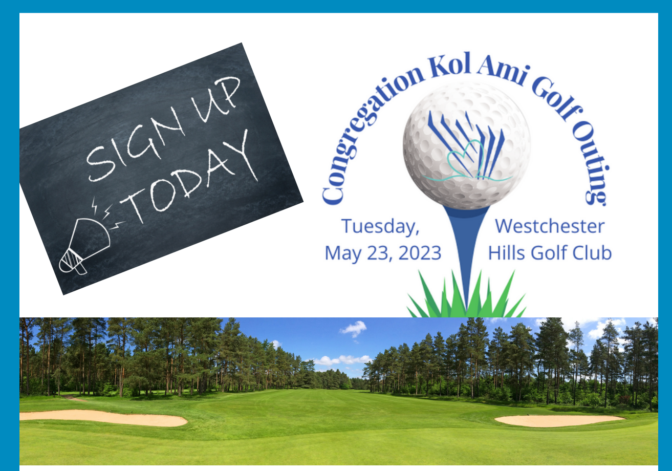
Join us for some golfing fun at the