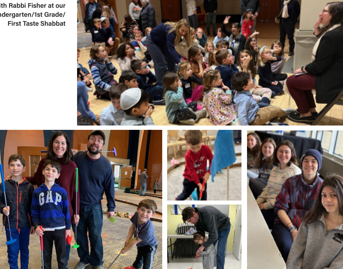
Teeing off for a good cause! Our Religious School kids enjoyed a hole-in-one experience at the indoor mini golf fundraiser, where the entire building became an 18-hole adventure.