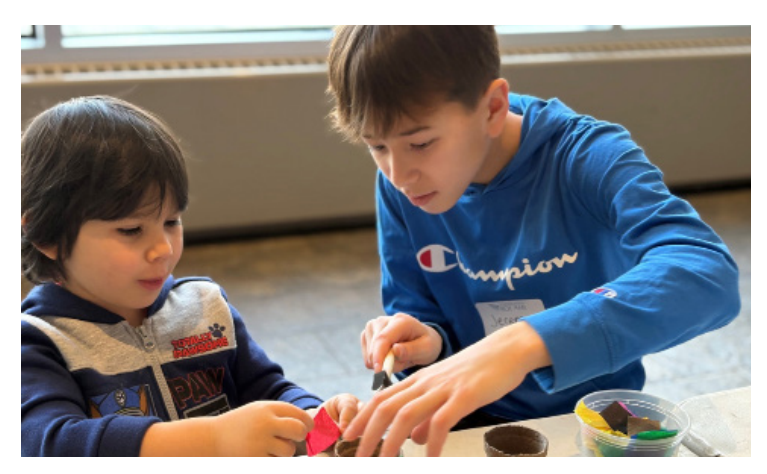
Lending a hand at Tot Shabbat on Saturday mornings, spreading joy and connection to our youngest participants.